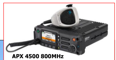
APX 4500 800MHz

Two Motorola mobile radios are mounted in East Selkirk's new pumper. An XPR 5550 VHF radio provides on scene and on-route communications and an APX 4500 enables FleetNet connectivity.