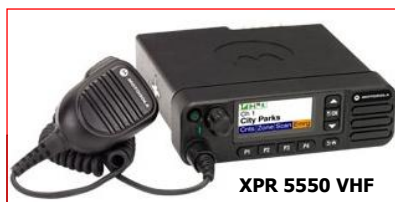
XPR 5550 VHF

Two Motorola mobile radios are mounted in East Selkirk's new pumper. An XPR 5550 VHF radio provides on scene and on-route communications and an APX 4500 enables FleetNet connectivity.