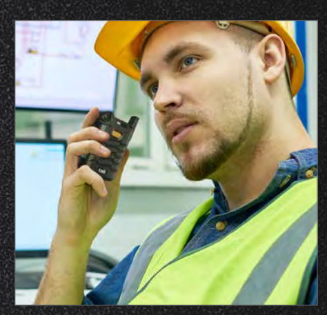
Support personnel can be more productive when joining the broader conversation.