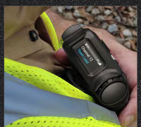
Lone workers can feel safe knowing their distress calls and location will make it through.