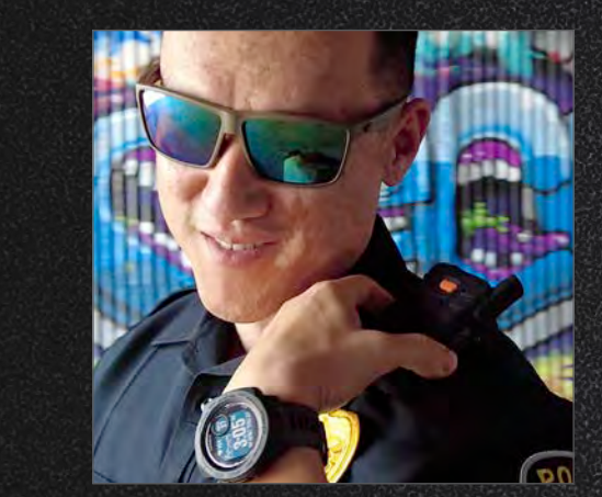
First responders can move confidently through buildings without a loss in conversation.