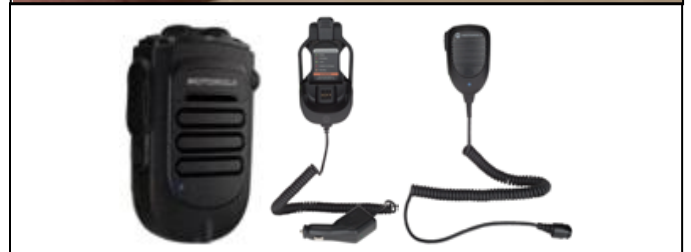
Long Range Wireless Remote Speaker Microphone Kit, for use with MOTOTRBO XPR 4000 and 5000 series mobile radios.